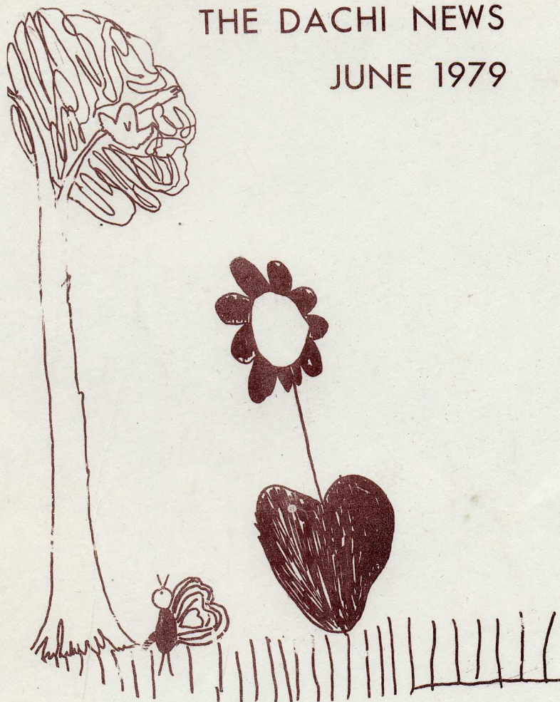
Laurie Flood age 7