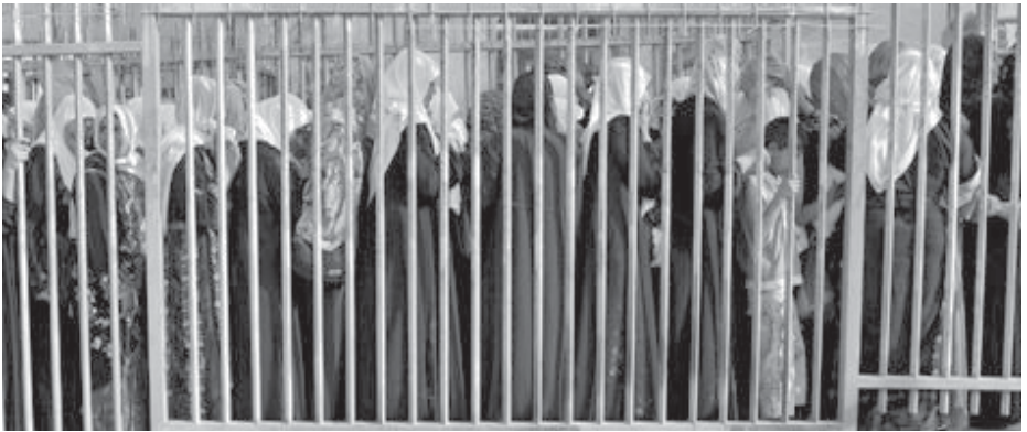
Palestinian women waiting in checkpoint near Bethlehem.