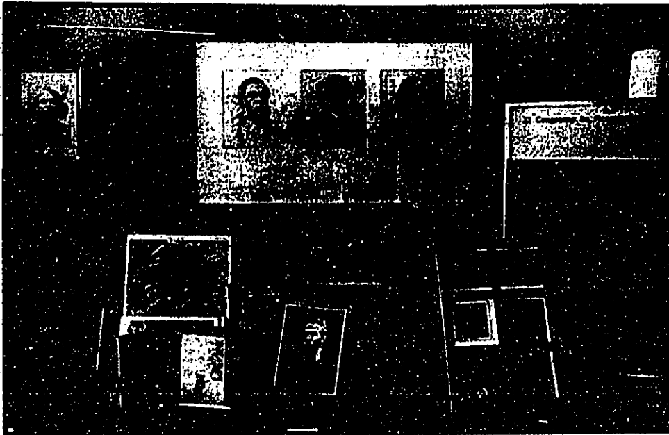
She lives among mementos alive with history. One faded photo (third from left in foreground) shows her in Trotsky's Mexican camp with a pistol strapped around her skirt. She once even saved his life.