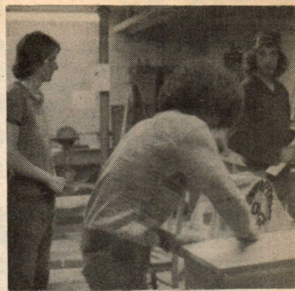
Interested in Woodwork? Here's your chance or maybe you need something made or repaired.