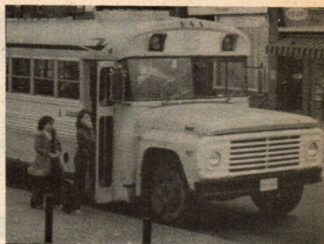
Off to swimming: Only one of the various outings that our bus is used for by the centre.

6. The friendship room is open everyday for adults. The room affords the opportunity of meeting new friends, reading (from its library) sharing common problems and solutions. This may be done over a cup of coffee and cookie. The room is open to both men and woman. 7. Coming soon - We are now in the process of setting up the first adult exercise room in the Park. The facilities will include - carpeted exercise room with modern equipment, and experienced instructors. After you work out, a sauna, sunroom and shower await! We will also have a personal exercise and weight program for you. We anticipate a heavy demand for this room registration, and therefore may have to be limited. Advance registration is now being taken.