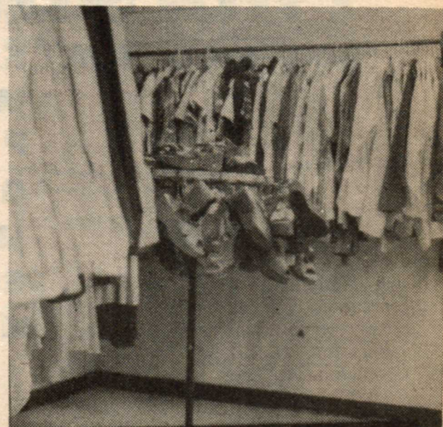
Lots of good buys: Store hours 1:30-3:15 pm. Mondays to Fridays.