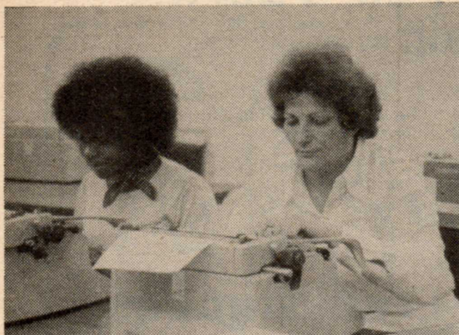
You can now prepare yourself for that office job you have hoped for. Training is done on both manual and I.B.M. Electric typewriters.