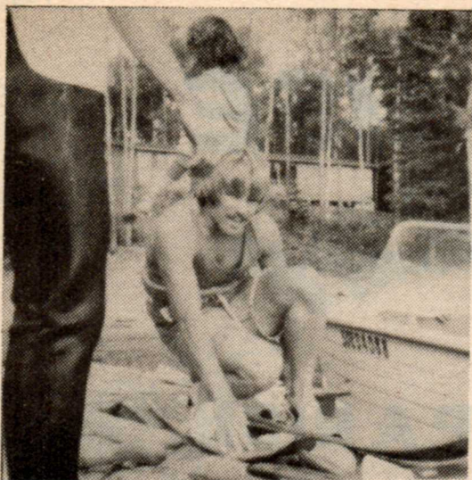
A shot from Teen Camp! Besides the Teen Camp - Several weeks are set aside for families at picturesque Len Lake Camp.