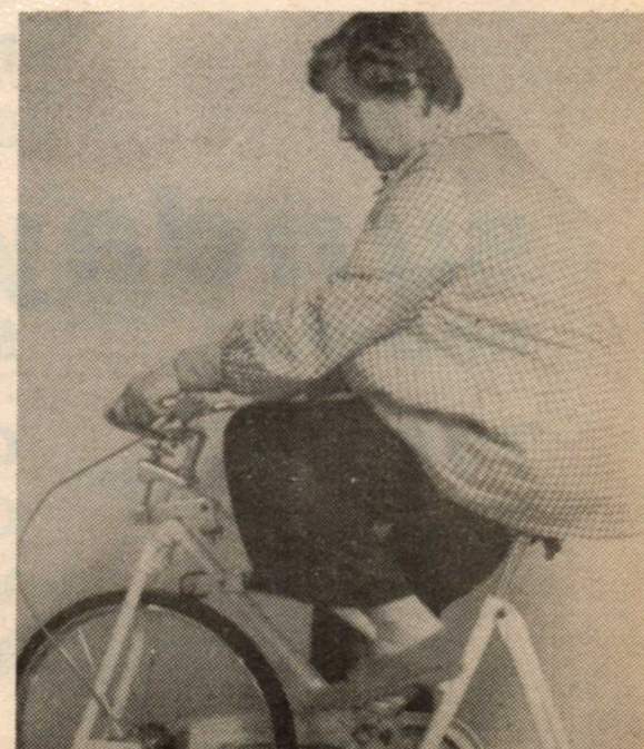
Now you can trim those pounds and shape up!