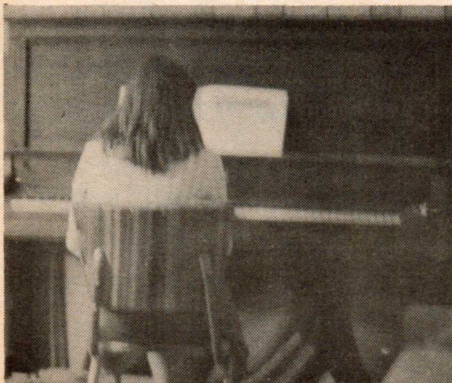
This old piano sees lots of action by the piano students and those coming to the friendship room.