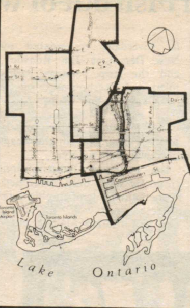
Map showing proposed provincial electoral redistribution. St. George riding (shaded area) will be absorbed by the three surrounding areas.