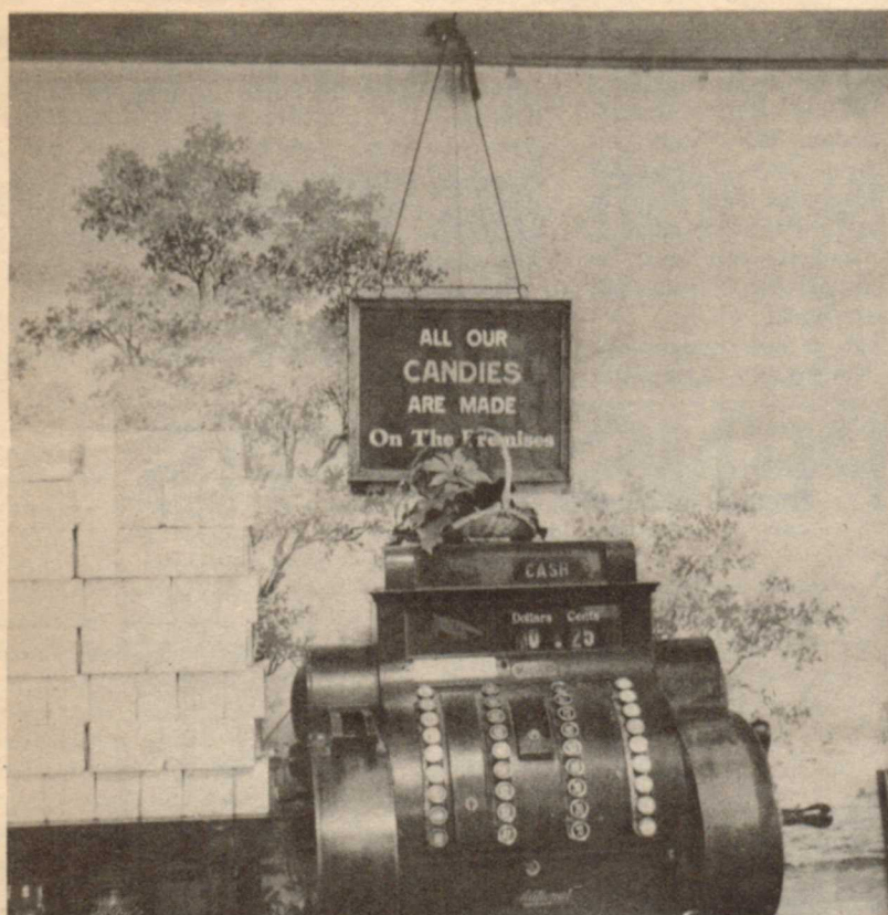
Candies made on the premises . . . since 1917.