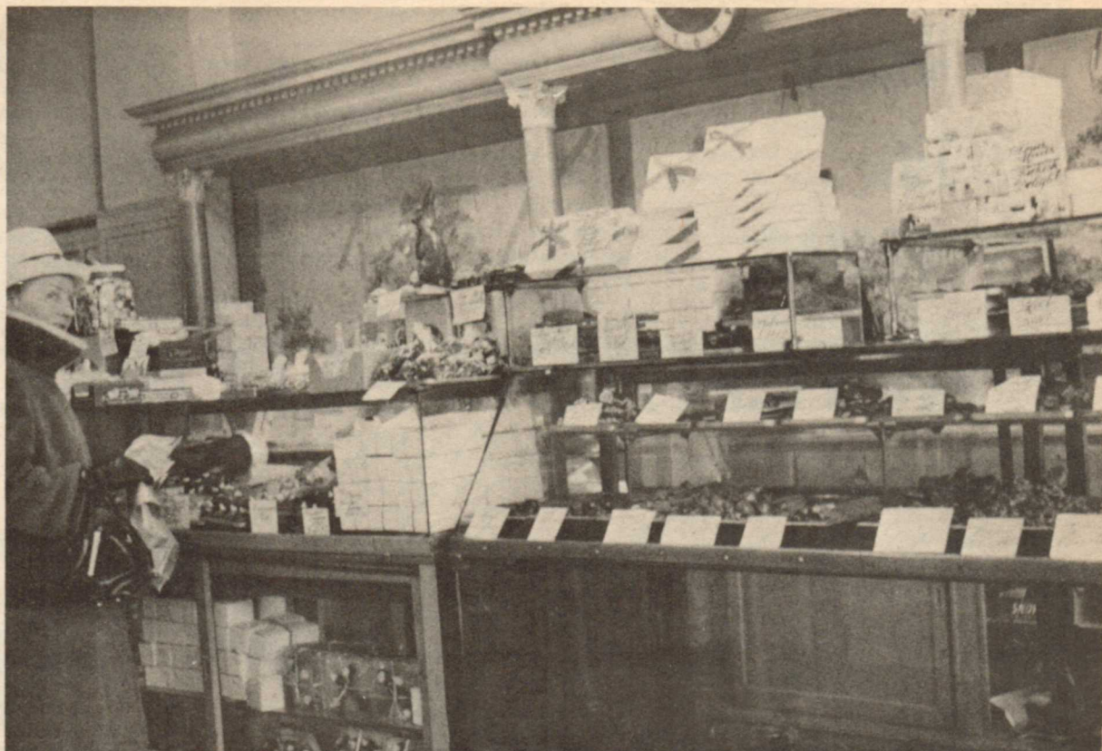
WOW! Maple cremes and walnut mallows and apricot jellies and . . .