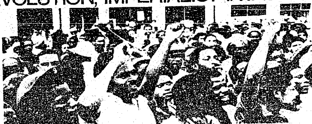
Supporters of Maurice Bishop in Grenada demonstrate to demand his release from house arrest.