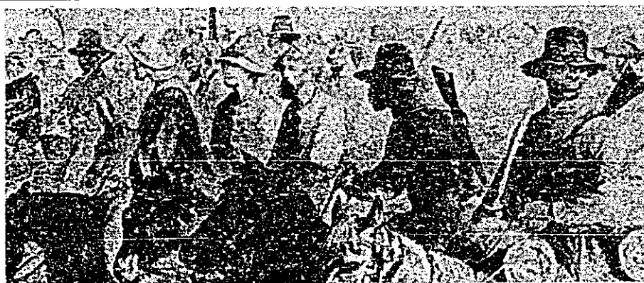
Black Union cavalrymen bring in Confederate prisoners during Civil War.

From his very first break with capitalism, as he discovered a whole new continent of thought and of revolu-