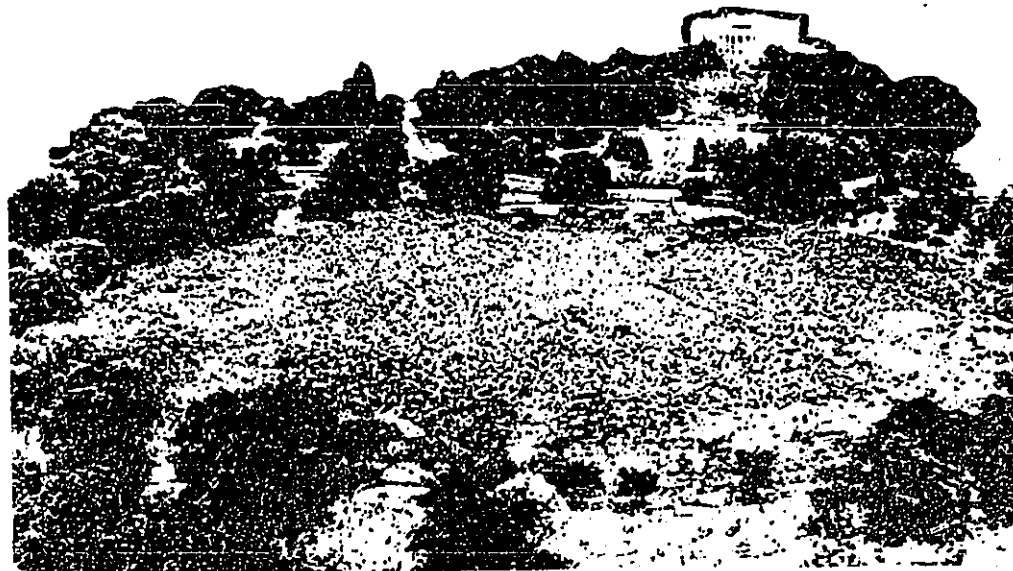
From his White House in the background, Pres. Nixon saw and heard the more than 150,000 who massed on May 9 to oppose his war-sending policies in Indo-China.

At the same time, it is clear that the struggle against the war must deepen to the point where it concerns itself with the struggle against the whole system which produces war — capitalism.