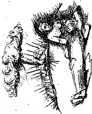
—Hiroshima, August 6, 1945