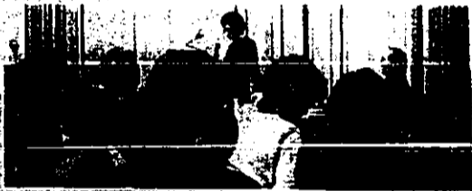
Audience at Dunayevskaya lecture...

The decisions, made simultaneously at the very first convention of News and Letters Committees, were to have a Black production worker as editor of its paper, and to assign the National Chairwoman, Raya Dunayevskaya, to complete the first major philosophic — and not only economic-political — work, Marxism and Freedom, on which she had been working for several years.